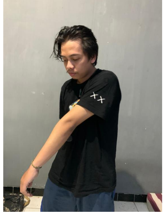
Flexion Upper Extremity Joint