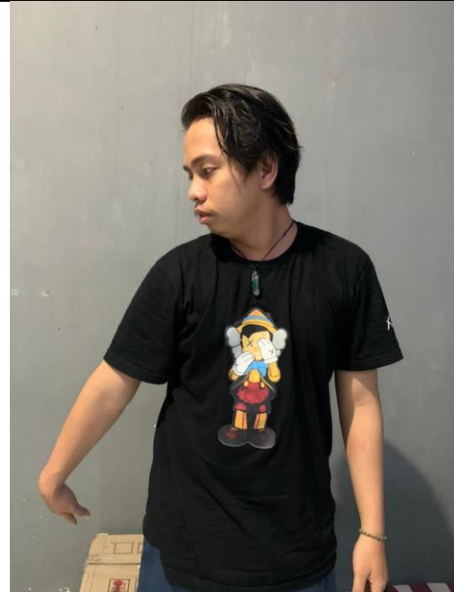
Flexion Upper Extremity Joint