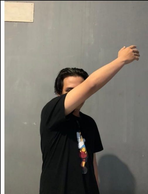
Flexion Upper Extremity Joint