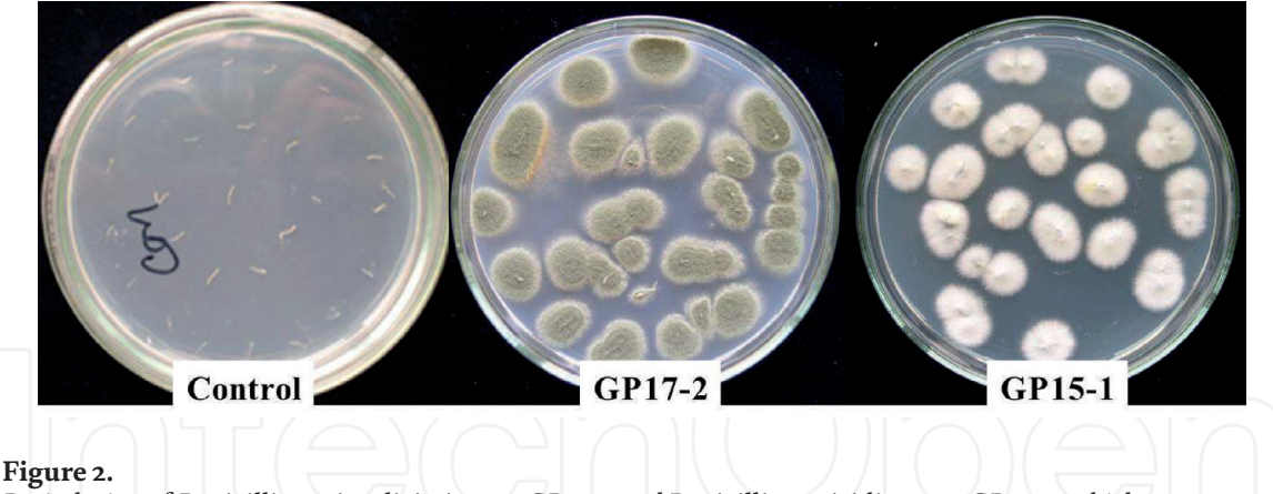
Re-isolation of Penicillium simplicissimum GP17-2 and Penicillium viridicatum GP15-1 at higher frequencies from colonized roots of Arabidopsis thaliana ecotype Col-0 3 weeks after sowing.

stimulated expression of these genes was induced by Pe. simplicissimum and F. equiseti [89]. T. koningi resembles symbiotic fungi, while Pe. simplicissimum and F. equiseti act similar to fungal pathogens in activating host defense. This shows that legumes selectively avoid some PGPF and thus allow only specific PGPF to interfere.